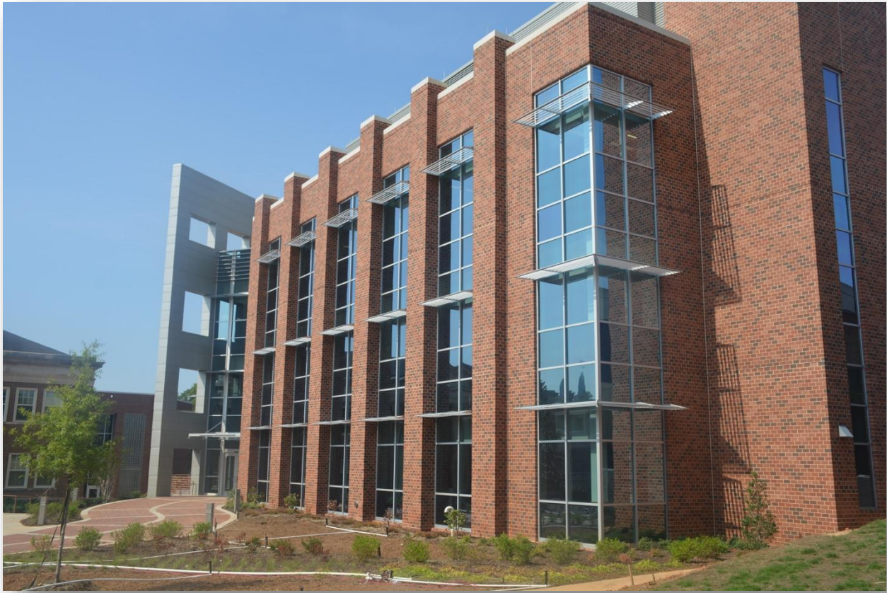
Johnson C. Smith University's new Science Hall opened in Fall 2015 and received a LEED-Silver status for its energy efficient design features.